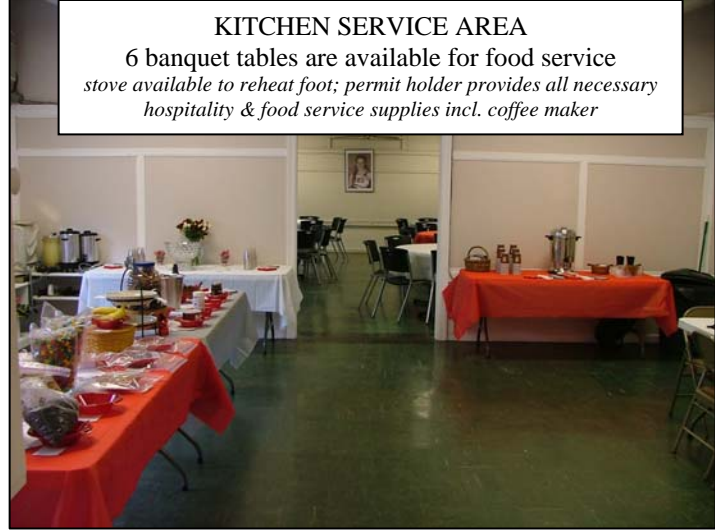
KITCHEN SERVICE AREA 6 banquet tables are available for food service stove available to reheat food; permit holder provides all necessary hospitality & food service supplies incl. coffee maker