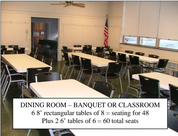
DINING ROOM - BANQUET OR CLASSROOM 6 8' rectangular tables of 8 = seating for 48 Plus 2 6' tables of 6 = 60 total seats