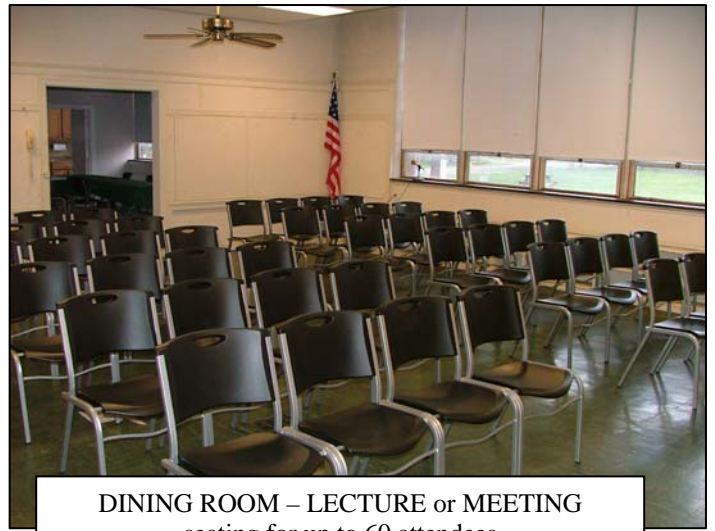
DINING ROOM - LECTURE or MEETING seating for up to 60 attendees AV is available with pre-request