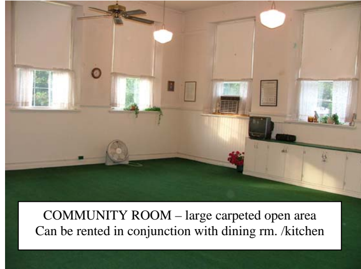
COMMUNITY ROOM - large carpeted open area Can be rented in conjunction with dining rm. /kitchen