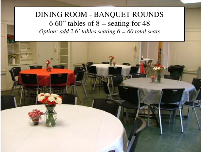
DINING ROOM - BANQUET ROUNDS 6 60" tables of 8 = seating for 48 Option: add 2 6' tables seating 6 = 60 total seats